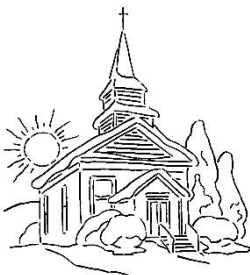
Christmas Day Worship Service

You are invited to share what you are thankful for by writing it on one of the Leaves of Gratitude available in the Gathering Area. The leaves will be secured to a banner in the sanctuary during November as we all count our blessings. Place your leaf in an offering plate.