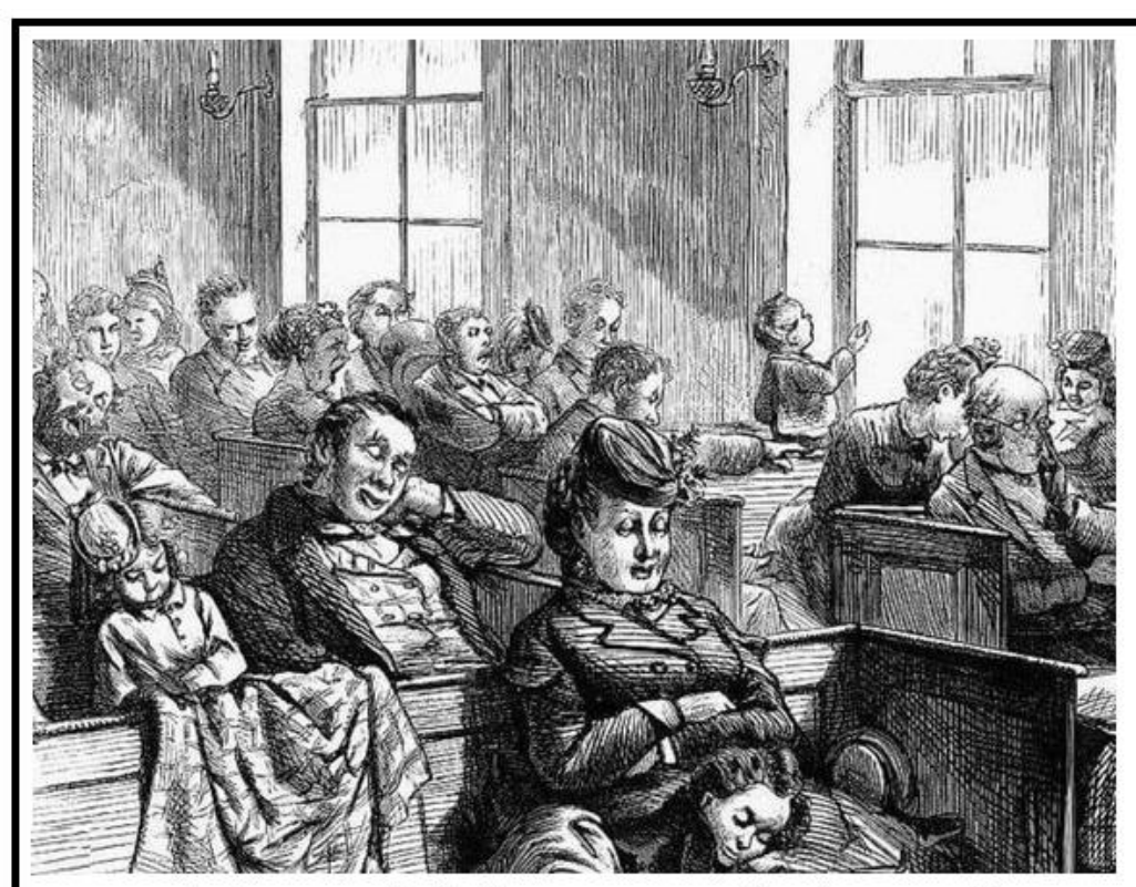
A later (19th-century) view of a sleeping congregation