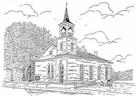
Organized June 6, 1818